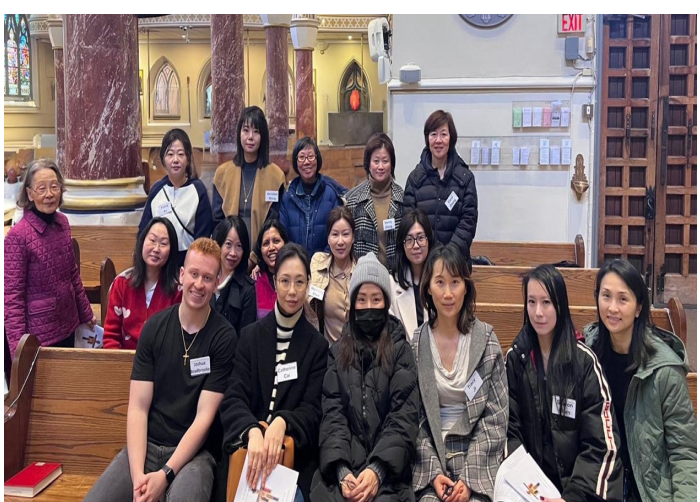
THANK "Dear Elect, thank you for your response to the call of God. Can't wait for your Baptism in Easter!"