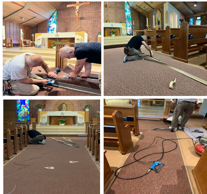
Your support has helped for replacing old carpet flooring inside the Church.

As of July 15, 2024, we have received 60 pledges with a total of $55,640.13. Thank you to those who have submitted their pledges and those who haven't please drop off your pledges and help us reach our goal.