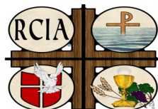
Rite of Christian Initiation for Adults

As of July 29, 2024, we have received 70 pledges with a total of $63,840.13. Thank you to those who have submitted their pledges and those who haven't please drop off your pledges and help us reach our goal.